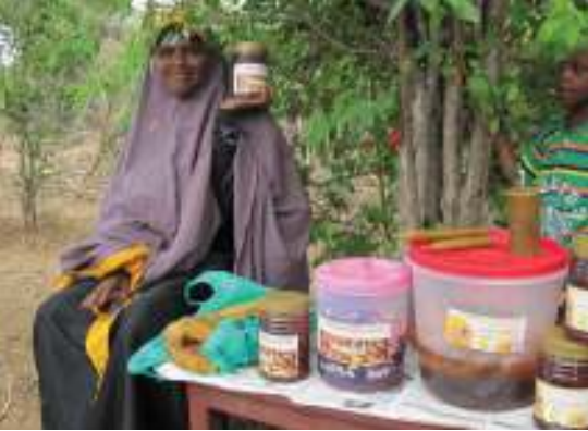
Honey producers group at the Nanighi farmer field day, Garissa, Kenya