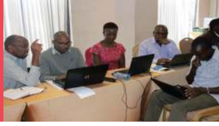
Participants engaged during the development of the curriculum on mainstreaming climate change

Mainstreaming Climate Change into National and County Policy, Planning and Budgetary Processes