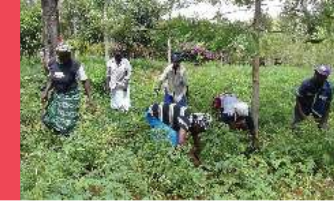
Farmers tending to their potato farm at Kiolo village in Meru County. Crop Insurance will help to manage risks and losses among smallholder farmers.

Agriculture is one of the most important sectors in the Kenyan economy, providing source of livelihoods to majority of Kenyans and foreign exchange earnings to the country. The sector is highly sensitive to climate change, affecting production in smallholder systems that have little adaptive capacity. The Ministry of Agriculture, Livestock and Fisheries officially launched the National Agriculture Insurance and Risk Management Program for rollout and expansion throughout the country in March 2016. This article highlights the progress made and future planned activities.