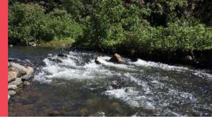
Aberdare forest ecosystem.

Kenya's economy has a very strong dependence on the natural environment and, in particular, forestry resources. Forestry supports most sectors, including agriculture, horticulture, tourism, wildlife, and energy. A large rural population depends on woodland and bush resources to provide firewood, charcoal and other forest products. Further, the contribution of forests in water catchments protection is critical to Kenya's rural and urban water supplies.