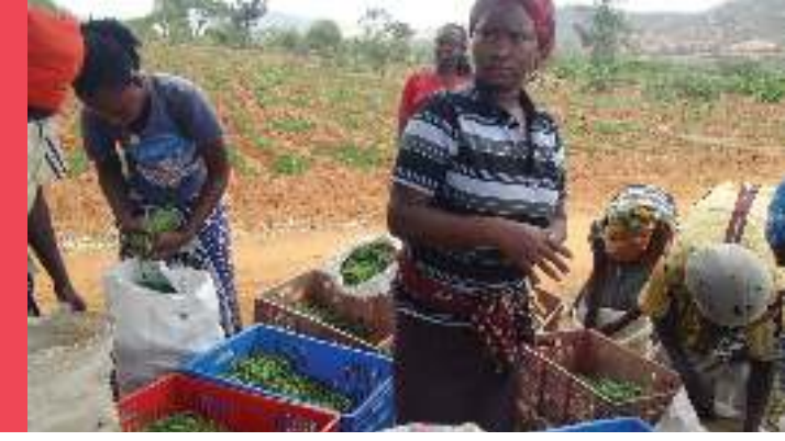
Women sorting and grading french beans in Kabaa irrigation scheme in Machakos County.

The Arid and Semi Arid Lands (ASALs) in Kenya, occupy 89% of the country and have the lowest development indicators and the highest incidence of poverty in the country. Climate change in the ASALs is depicted by increased frequency of prolonged drought and erratic rainfall patterns: impacting negatively on agricultural practices. A number of climate smart agriculture projects have received support from both government and non-governmental organizations. The government in partnership with various development agencies such as the World Bank, Africa Development Bank, IFAD, AGRA among others among others have shown their commitment towards supporting climate smart agriculture in the ASALs to increase productivity for reducing vulnerability to the climate change impacts.