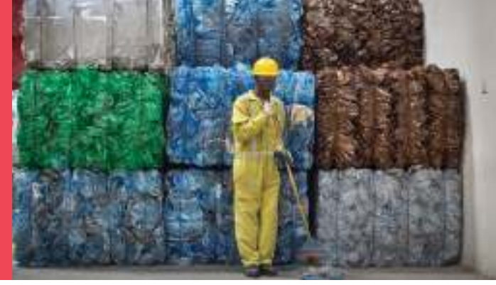
Flattened plastic waste ready for recycling.

The processing and systematic professional management of waste can enable Kenya attain the constitutional entitlement to a clean and healthy environment. Sadly, inappropriate disposal of waste evidenced by litter everywhere and pile-up of garbage in major towns and cities of Kenya is the norm. The different types of waste as recognized in the Waste Management Regulations of 2006 include; industrial wastes, pesticides and toxic biomedical, substances, radioactive substances, electronic waste, organic and construction waste.